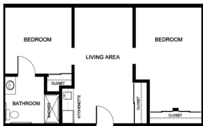
TWO BEDROOM 663 S.F.