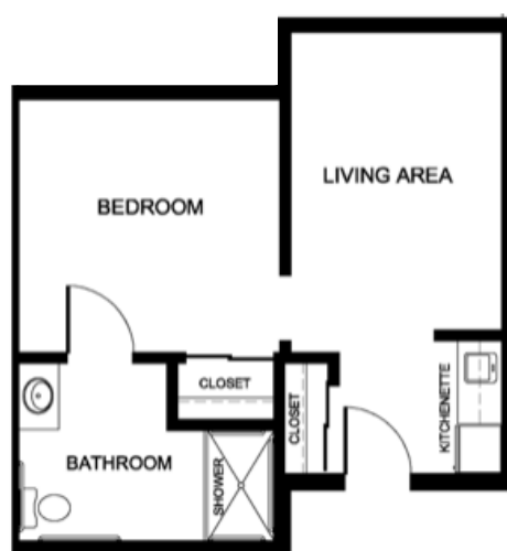
ONE BEDROOM 425 S.F.

State-of-the-art emergency call systems are available in resident apartments and worn by the resident as a pendant to further promote safety.