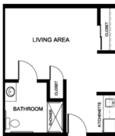
STUDIO 347 S.F.